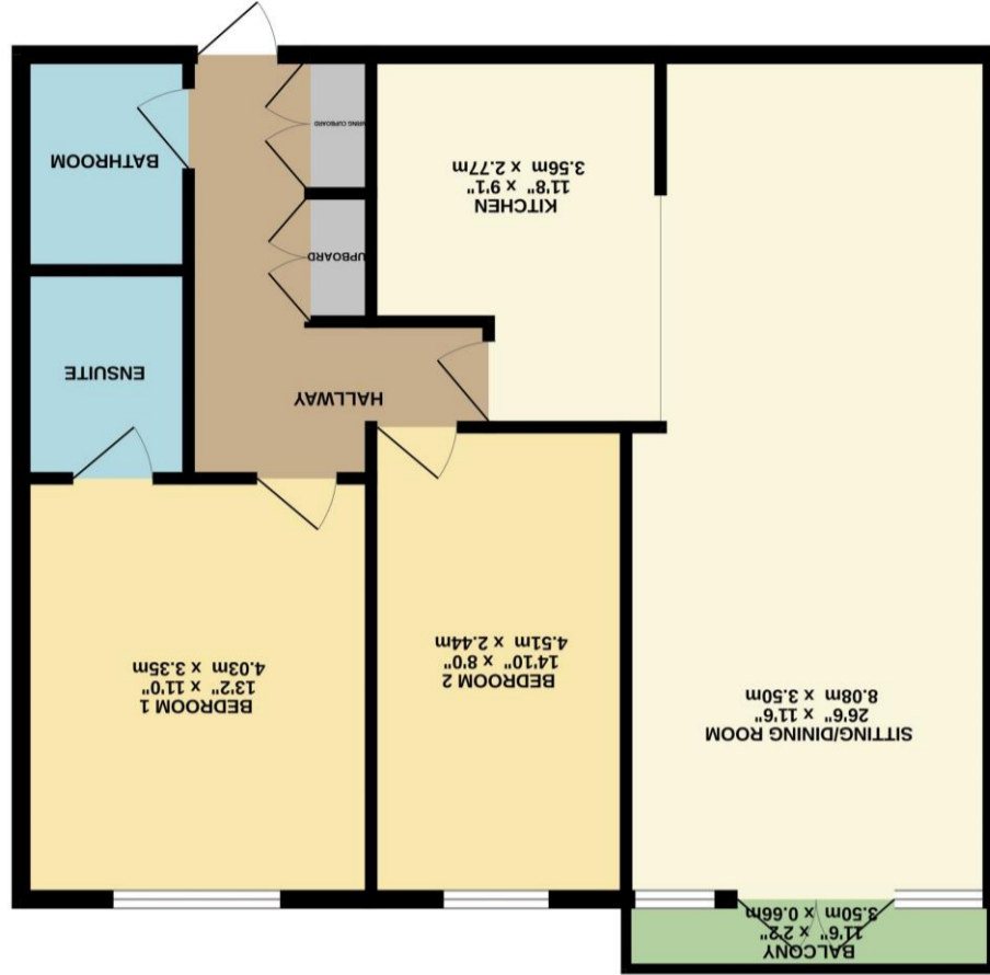
GROUND FLOOR 807 sq.ft. (75.0 sq.m.) approx.

While every attempt has been made to ensure the accuracy of the figures contained here, measurements of doors, windows, rooms and other fittings and appliances shown have not been made and no guarantee is given as to their quantity or accuracy. This plan is for information only and is not to be used for any prospective purchase. The services, systems and appliances shown have not been made and no guarantee is given as to their quantity or accuracy. This plan is for information only and is not to be used for any prospective purchase.